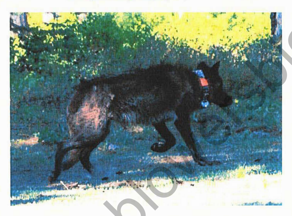
OR 28 female gray wolf

Brent Lawrence, brent_lawrence@fws.gov, (503) 231-6211