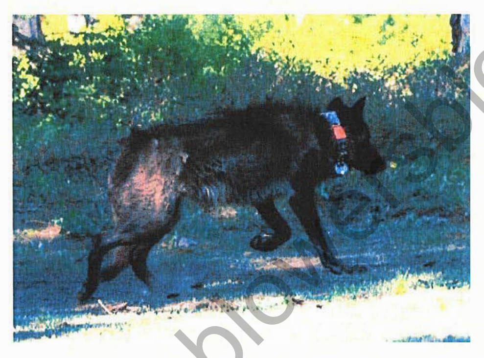
OR 28 female gray wolf

Brent Lawrence, brent_lawrence@fws.gov, (503) 231-6211